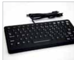
Fully Sealed Keyboard