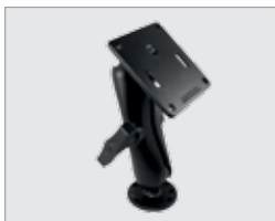
Ball joint mount