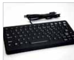
Fully Sealed Keyboard